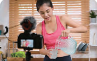
Self Media/Vlog Live