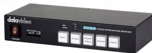
Datavideo NVS-33 Recorder/ streamer

T he HS-1300 has six inputs; the HS-3200 has 12 inputs; and the HS-1600T has four inputs, which add camera control to three HDBaseT PTZ cameras, as well. The HS-2850 and HS-2200 will switch and mix, and offer integrated communications and tally. The record and stream functions can be added separately.