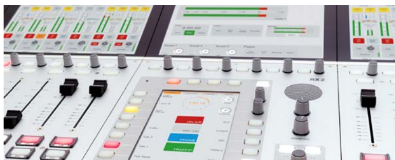
DHD.audio Series 52 mixing console

Exciting products on the Concilium Technologies stand this year include the