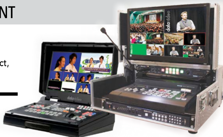
Datavideo HS-1300 and HS-650 Mobile Video studios

Datavideo has built a mobile studio into an attaché case! Three Hand-Carry Solutions (HS) provide the ultimate integrated product, allowing users to switch, mix, record and stream.